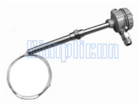
MI sensor with 12" long Nipple Union Nipple connection