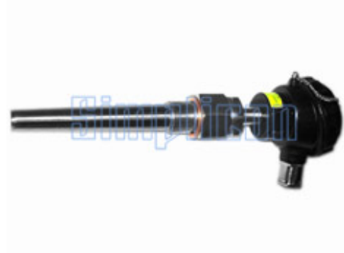
Textile sensor of 10mm dia x 94mm with no lead breakage and easy removal design.