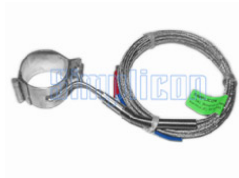
Clip on type thermocouple assembly for pipeline temperature measurement.