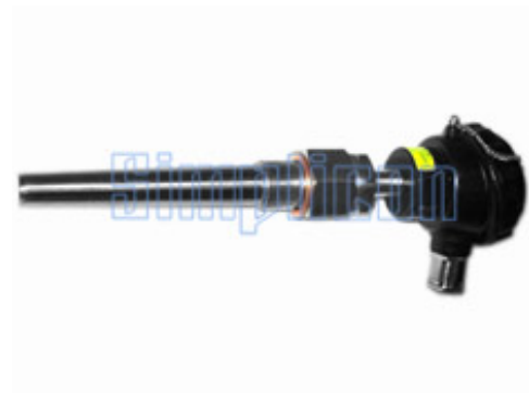
Thermocouple assy with tapered thermowell and copper washer for high temp. with pressure applications.