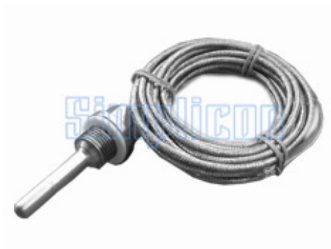
Special Teflon washer design.