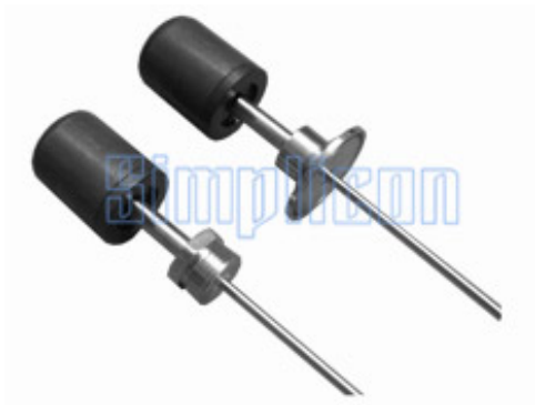
Assemblies with triclover flange and PVC head